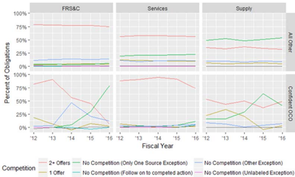
Figure 2. Competition Across Facility-Related Services and Construction, Other Services, and Supplies

While competition is more prevalent in contingency contracting, the trend has changed for the worse. Figure 2 also shows that noncompetitive contracting has become more prevalent in all three categories. The trend is most alarming in FRS&C where competition rates have cratered, which is particularly troubling because this is classically a sector where a range of different vendors can easily enter to provide services. The trend for other services involves a slow decline, which is typical in contracting markets. However, the rise in noncompetitive contracts in supplies is not necessarily as problematic as it first appears. Much of the decline has been in competition that results in only a single offer. Noncompetitive procedures do have tools to help when only one vendor is available, so going directly to these arrangements may be preferable to competitions that only ever attract one vendor. Nonetheless, the goods acquired in contingency contracting are often simpler than the advanced weapon systems acquired domestically. There may be an opportunity in this sector for greater use of competition.