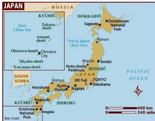
Figure 2. Map of Japan (“Map of Japan,” 2012)

Japan is one of the largest economies in Asia and the third largest in the world, with a 2010 gross domestic product (GDP) of $5.391 trillion/$34,200 per capita. The country is highly industrialized and extremely competitive in areas linked to international trade, with the exception of agriculture, natural resources, and services. Its society is highly urbanized, with only approximately 4% engaged in agriculture (DoS, 2012).