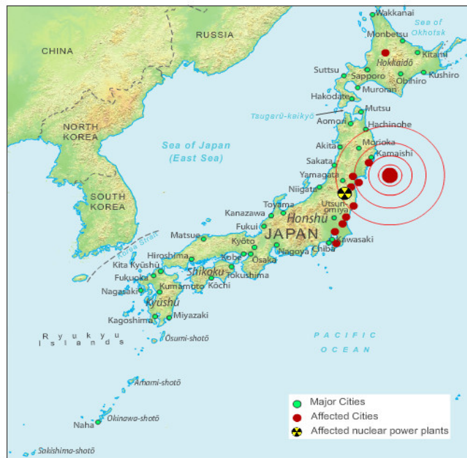
Figure 1. Map of Earthquake Epicenter ("Cites Affected," 2012)

On March 11, 2011, at around 12:46 a.m. EST (2:46 p.m. Japan Standard Time), Japan was hit by a 9.0-magnitude earthquake and subsequent tsunami, now known as the 2011 Tohoku earthquake and tsunami. The epicenter was located 80 miles east of Sendai, the capital of Miyagi Prefecture, and 231 miles northeast of Tokyo.