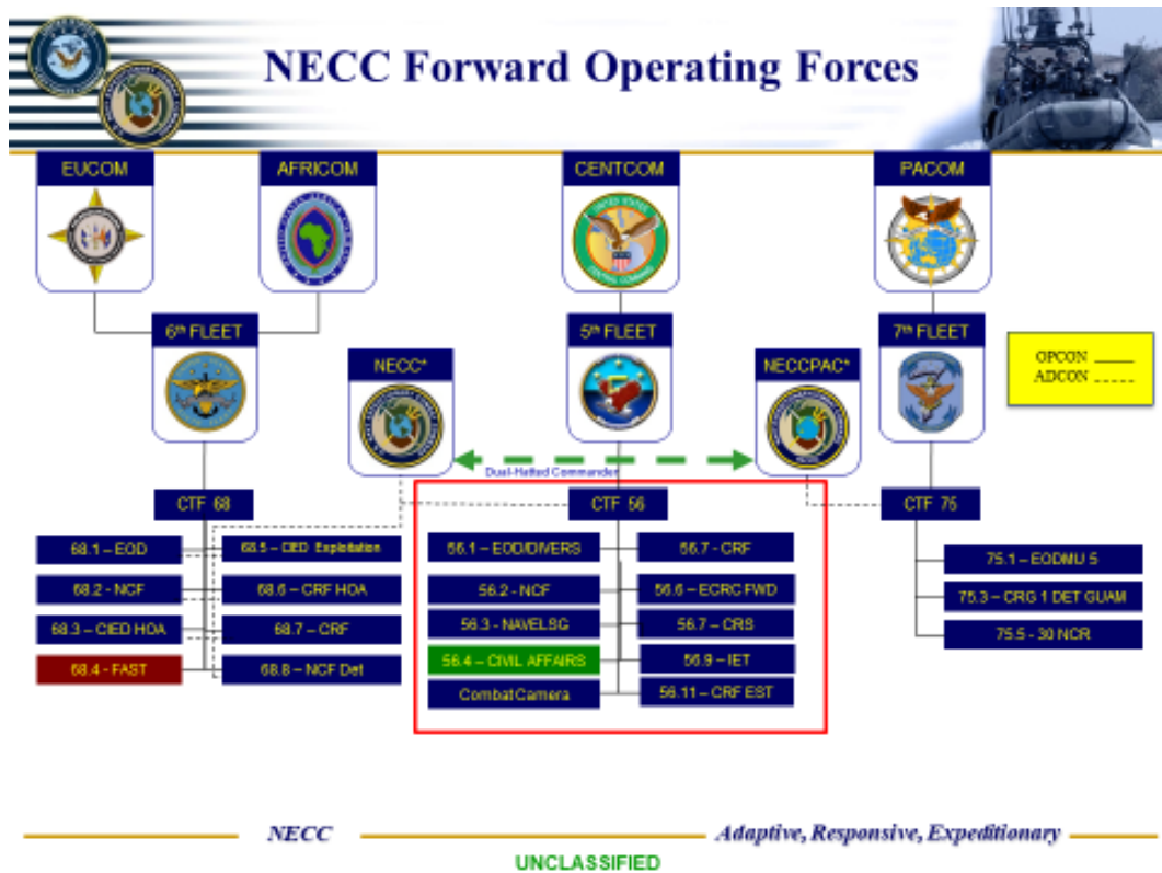
Figure 2. Command Relationship between COCOMs, NECC/NECCPAC, and CTFs. Source: R. Cullinan, personal communication, September 5, 2018.

NECC maintains administrative command (ADCON) of the units as they deploy to CTF 56 continually even after they enter the theater. Central Command (CENTCOM) is the Combatant Commander responsible for all the operations conducted within the AOR. Under CENTCOM, the U.S. Navy 5th Fleet/NAVCENT are responsible for all U.S. and coalition naval assets within CENTCOM. CTF 56 falls under 5th Fleet/NAVCENT for both ADCON and operational control (OPCON). When NECC forces such as CRF, EOD, and NCF deploy to CENTCOM, they fall under CTF 56 for OPCON, and for their remaining time in theater they take all direction from CTF 56. The relationship between the COCOM, NECC, and CTF 56 can be seen in Figure 2. An illustration of how CTF 56 is support by NECC and NECCPAC through its subordinate commands that deploy from NECC and NECCPAC can be seen in Figure 3.