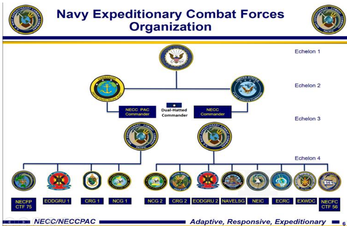
Figure 1. Organizational Structure of NECC.

NECC is the headquarters for all United States Navy (USN) expeditionary combat forces around the world, as shown in Figure 1. It provides combat service support and is directly involved in combat operations in numerous sea and land operating environments. The NECC’s primary “mission is to organize, man, train, and equip expeditionary combat forces” (NECC, n.d.). that will deploy with the Navy or that are attached to a Joint Task Forces Combat Service Support (NECC, n.d.).