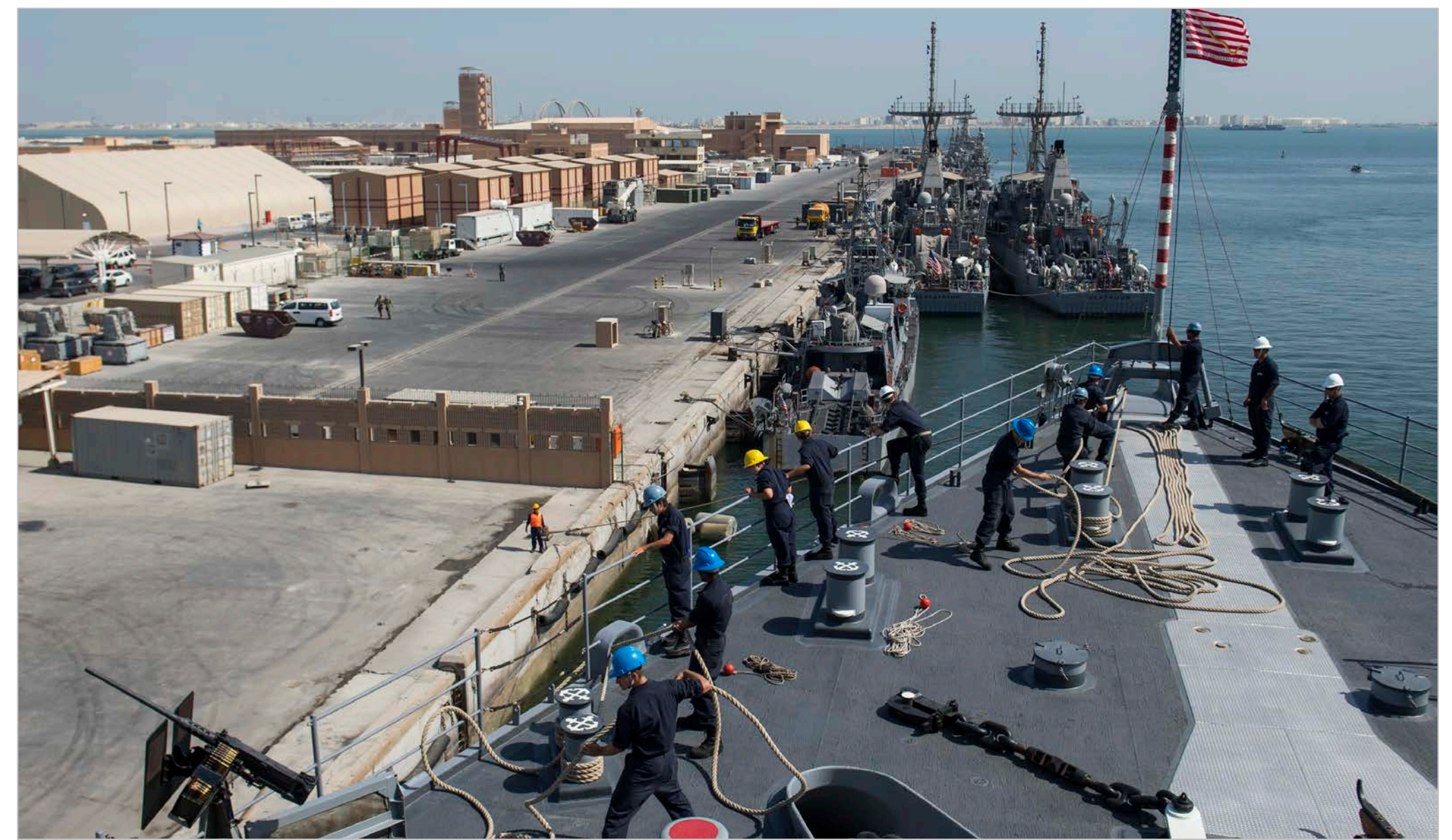
US Navy Vessel Pulling Into Port - Bahrain

HSPs are the primary provider of logistics support for ships operating in a forward-deployed environment and required access to sensitive information regarding a ship's movement to provide contracted logistics support. In order to preclude events in which security is compromised in the future, this report assesses the current vetting process and makes recommendations to improve the process to safeguard a ship's operating information while enabling the HSP to provide its contracted services.