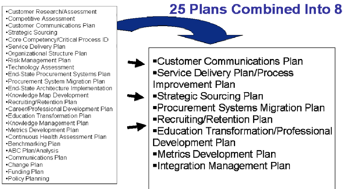
Figure 1: From: Executive Summary Procurement Transformation Strategy