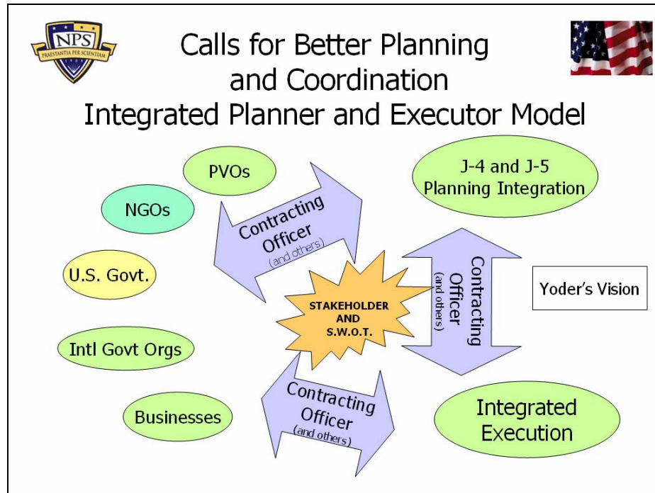
Figure 2. Integrated Planner and Executor Model

E. Cory Yoder, "Contingency Contracting—Achieving Better Results." NPS slide show, 2003. 16