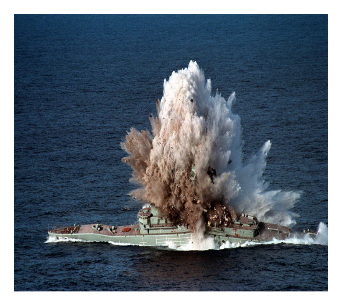
Figure 5. The Keel Has Broken (Navy Undersea Warfare Center, 1999)

Figure 5 clearly shows that the back of the destroyer has been broken. The extensive level of damage that is taking place is obvious.