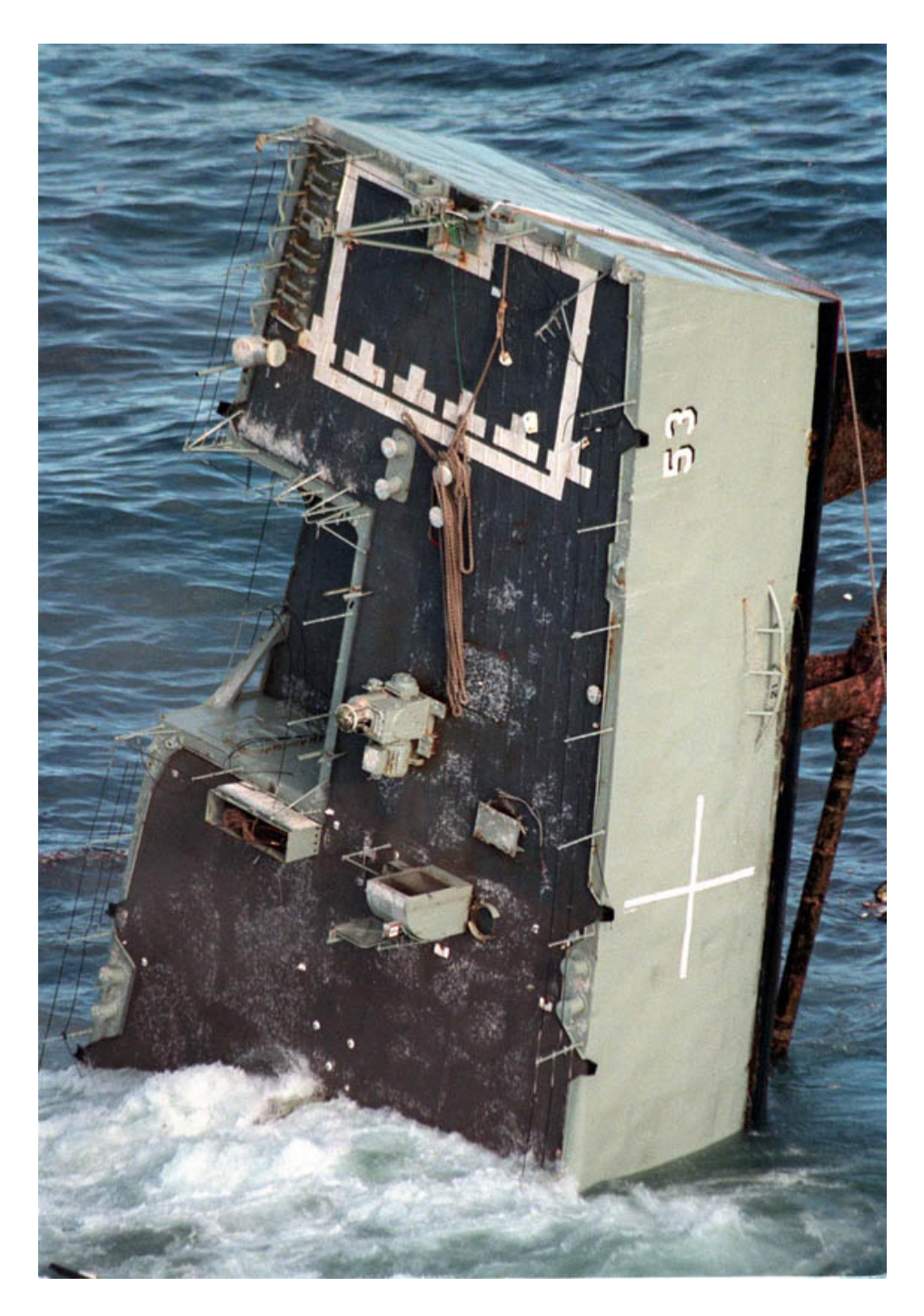
Figure 8. The Stern Slips Under the Waves

Figure 8 shows that the observation made in Figure 7 is accurate: the stern section is headed to "Davey Jones' Locker." The photograph in Figure 8 is a close-up of the destroyer as it slips beneath the waves.