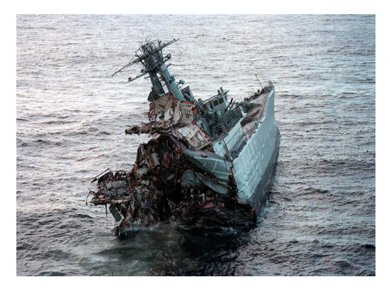
Figure 10. The Residual Bow Section (Navy Undersea Warfare Center, 1999)

Figure 10 is a photograph of the bow section of the ship. As the photograph shows, it is not economically repairable. The damage is so bad that by the time the Australian Navy would have tried to salvage what is left there in order to rebuild a new ship around it, it would have been better to have started from scratch. Plus, ship designs evolve, and if this were an older ship, it would probably be better from a cost-effectiveness standpoint to acquire a "latest and greatest" warship of a similar class to replace this one. In this test, the bow section actually sank a few hours after the photograph in Figure 10 was taken.