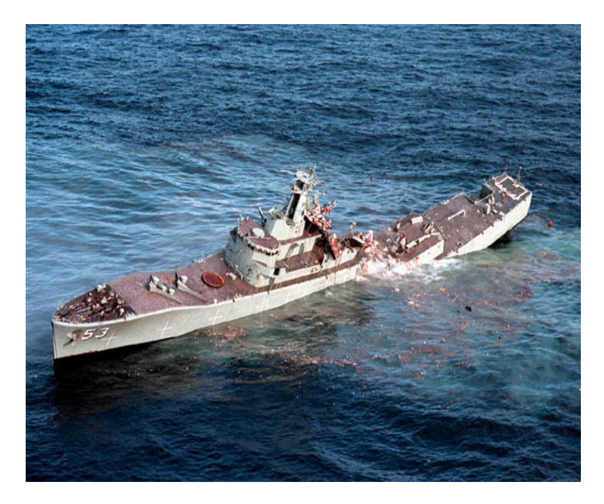
Figure 7. The Stern Begins to Sink (Navy Undersea Warfare Center, 1999)

As the smoke clears in the photograph in Figure 7, it is clear that the destroyer has broken into two halves and that the stern section is about to sink.