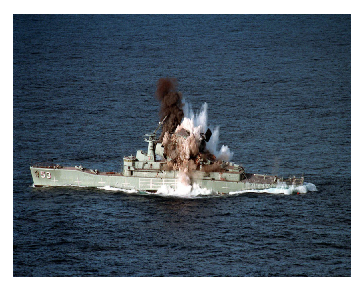
Figure 4.Further Damage(Navy Undersea Warfare Center, 1999)

Figure 4 is a photograph of a few seconds, maybe even milliseconds, later. The explosion has propagated even further, and the power of the torpedo warhead's explosive is visible as it goes straight up through the bowels of the ship along the center line—and it only gets worse.