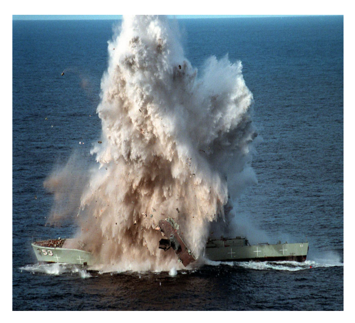
Figure 6 shows that the level of damage is now catastrophic.

Figure 6. Bow and Stern Sections Separate (Navy Undersea Warfare Center, 1999)