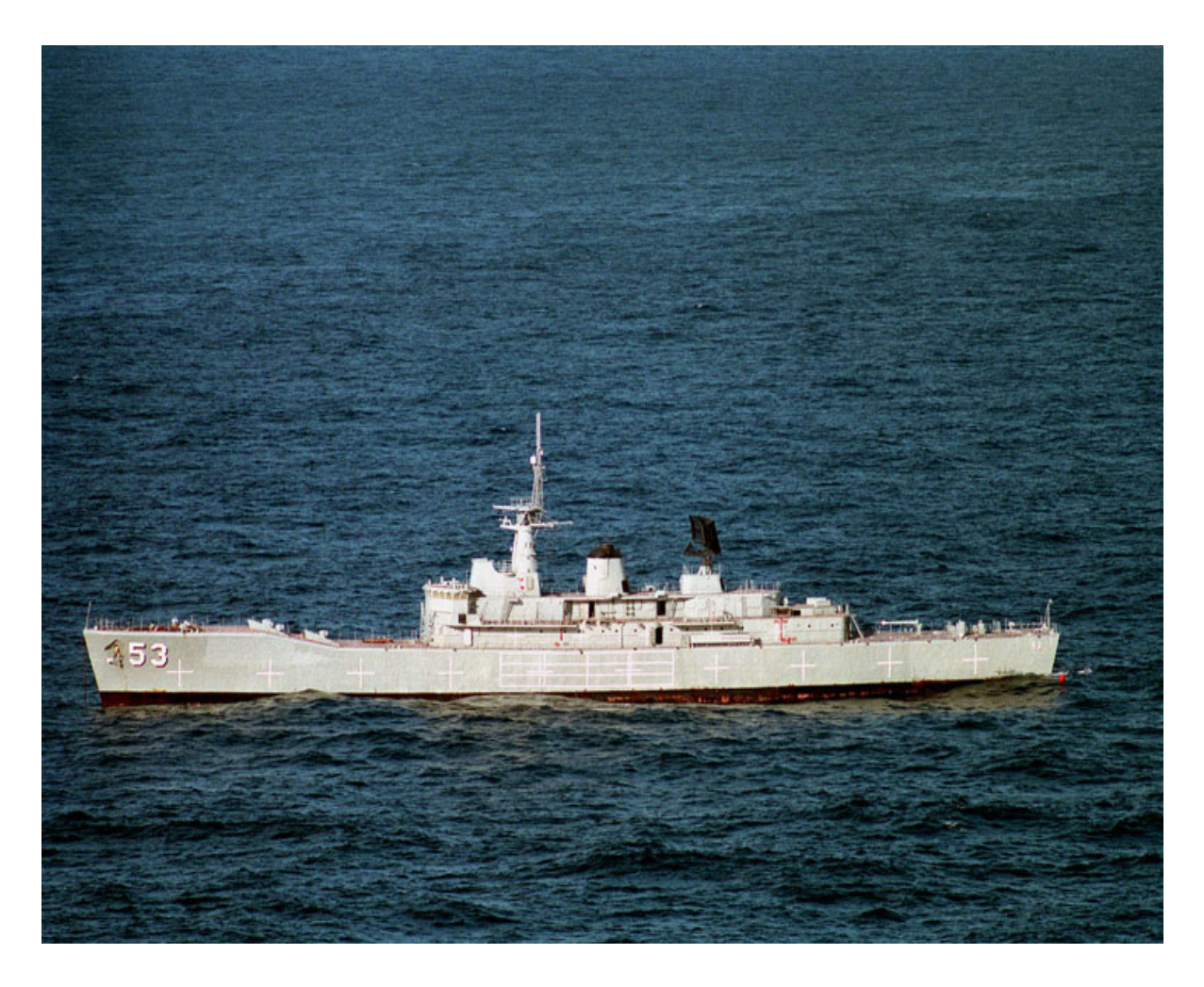
Figure 2. Destroyer Prior to Detonation (Navy Undersea Warfare Center, 1999)