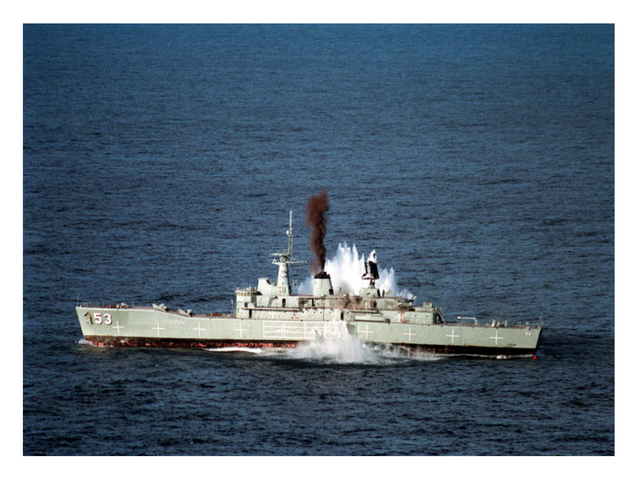
Figure 3. Initial Reaction (Navy Undersea Warfare Center, 1999)

Figure 3 is a photograph of the moment the torpedo was detonated. The photograph shows that smoke has been blown out of the stack because of the power of the explosion, and it shows that water is starting to erupt on either side of the ship. In Figure 3, the ship already appears to have had its keel broken because the bow and the stern are lower than the center of the ship.