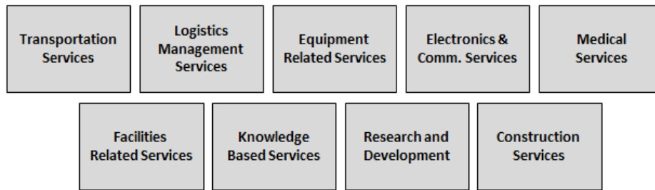
Figure 2. Services Acquisition Portfolio Groups