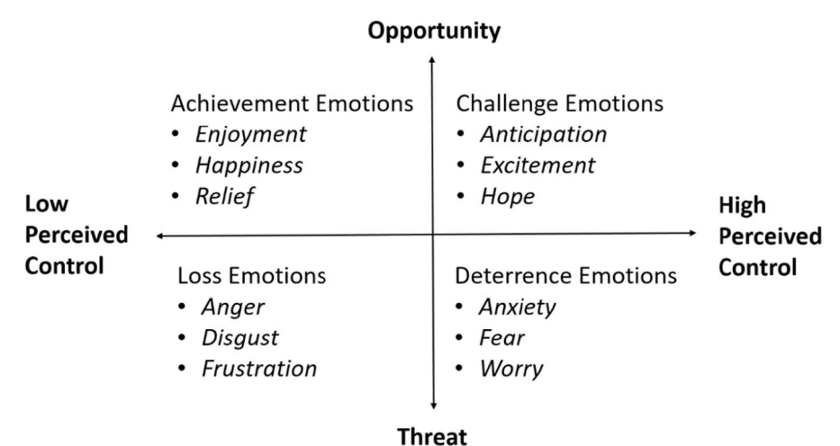
Figure 3. Emotion Categories in Beaudry & Pinsonneault (2010, p. 694).

The CMUA views both the initial communication and all status updates about an innovation as a chance for employees to evaluate the innovation. The quality of that information will determine whether the employee will view the innovation as an opportunity or threat to themselves and their organization (Beaudry & Pinsonneault, 2005, 2010). Following the threat versus opportunity analysis, employees then evaluate their perceived control or their ability to either mitigate the threat or flourish with the opportunity (Tsai & Compeau, 2021). Figure 3 shows the emotions based on both the threat and opportunity analysis and the evaluation of the extent to which the employee is in control. The emotions range from a favorable opportunity and high perceived control over the innovation event to, on the contrary, viewing the innovation as a threat and having low perceived control over the innovation (Beaudry & Pinsonneault, 2010).