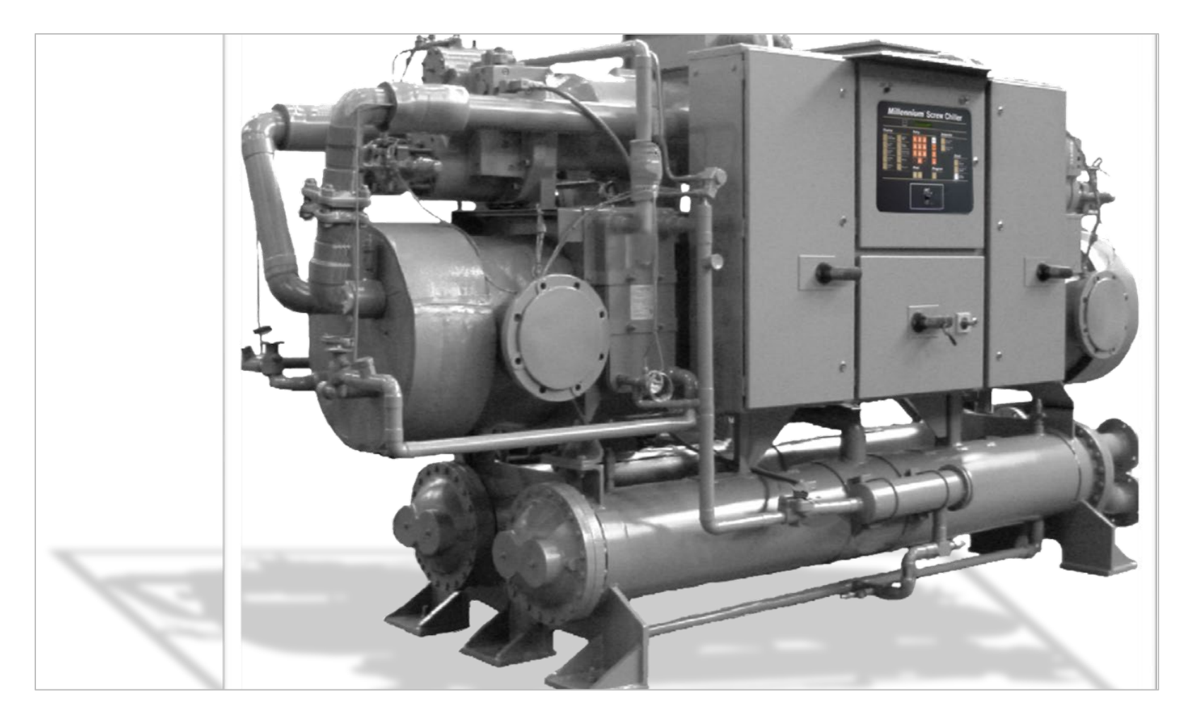
130 Ton Air Conditioning Chilled Water Plant