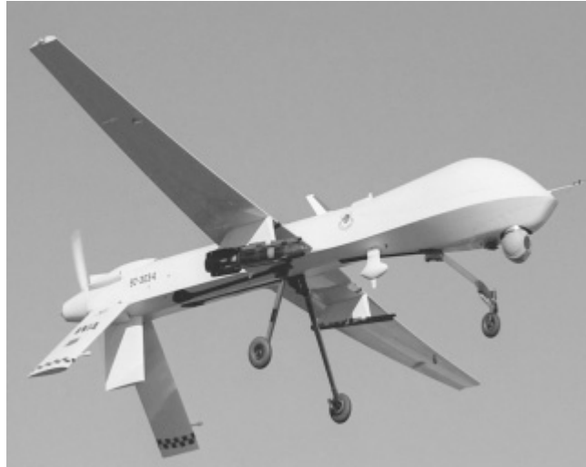
Figure 5. Predator A (Drew et al., 2005)