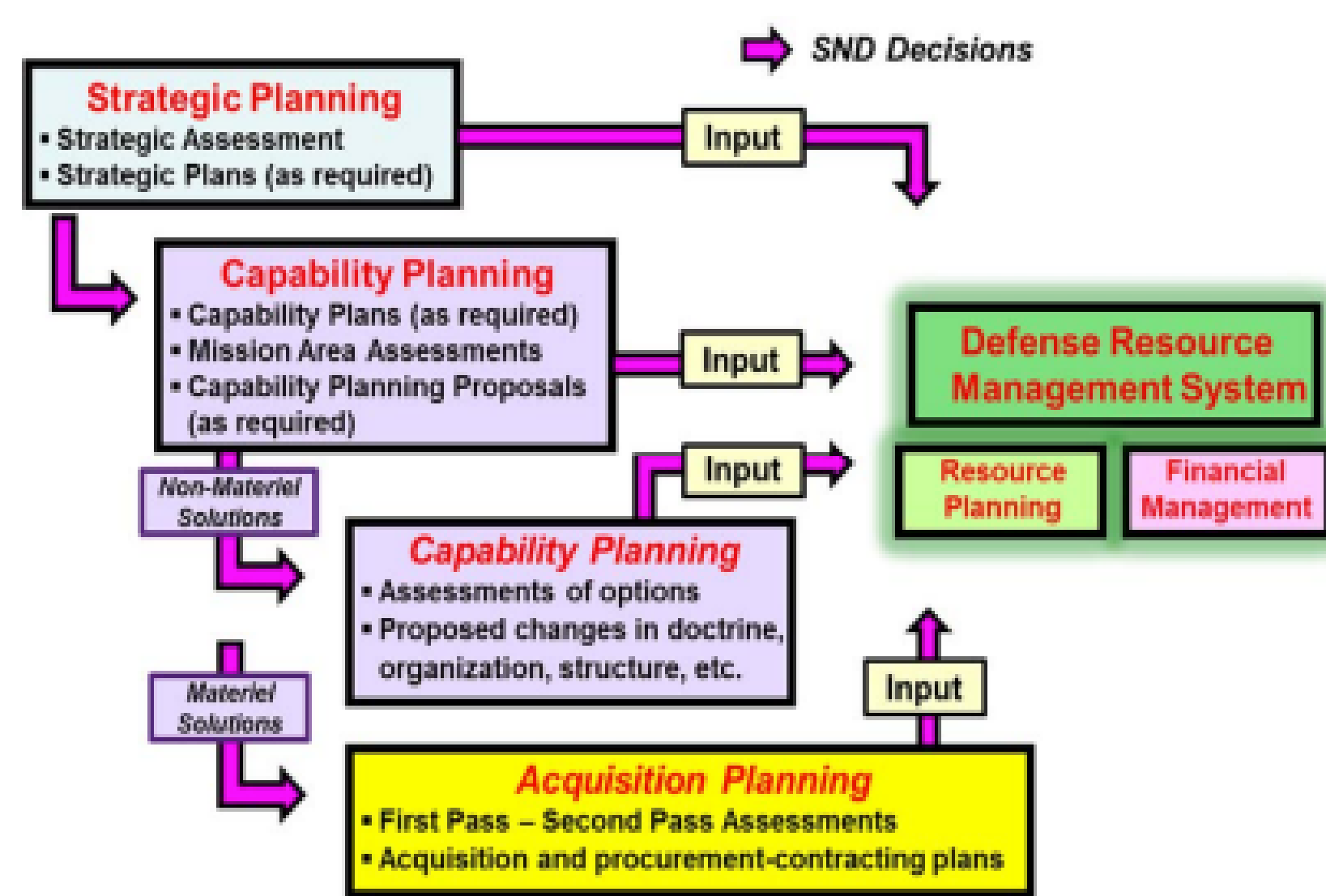
Defense System of Management