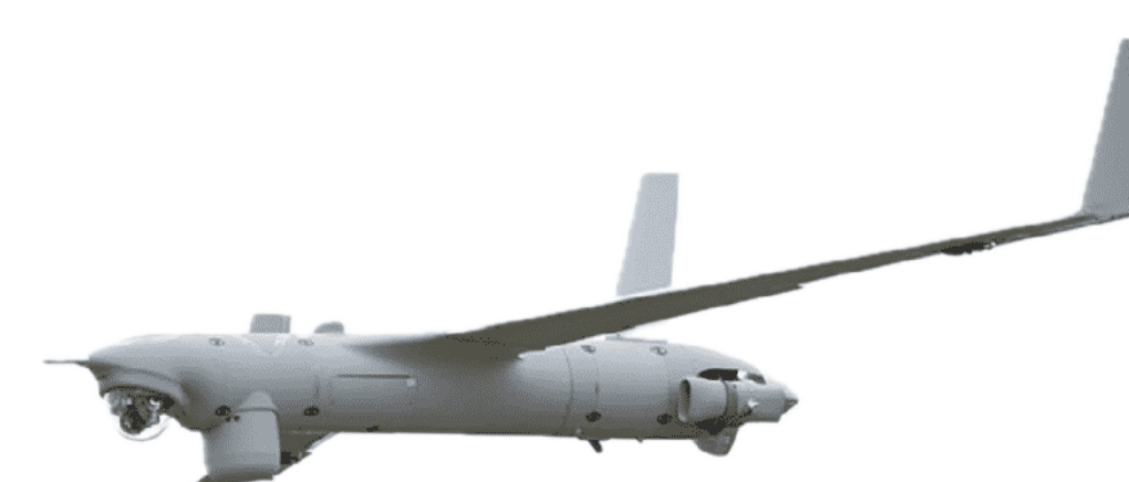
ScanEagle - Insitu