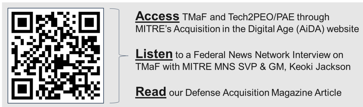
Figure 2. Engage with the TMaF and Tech2PEO/PAE via Resources Hosted at https://aida.mitre.org/tmaf

Get started with the TMaF and Tech2PEO/PAE today via the resources linked in Figure 2 and connect with questions/feedback by emailing tmaf@mitre.org !