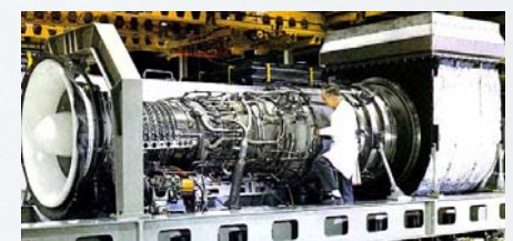
LM-2500 Propulsion System