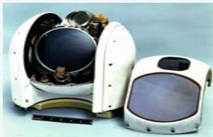
F/A-18 FLIR Optics Stabilizer

65% of items reparable ... highly complex supply chain