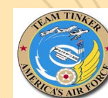
Other Service Depots