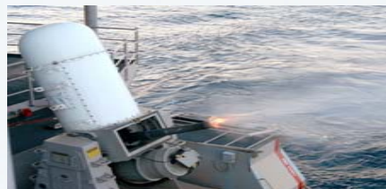
Close In Weapons System