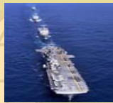
Marine Corps Aviation