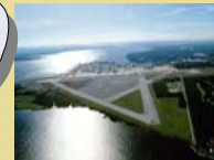
Naval Air Stations