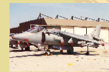
Marine Corps Air Stations